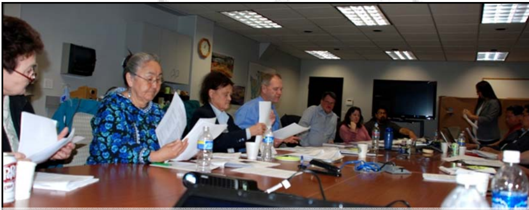
Work Group reviewing NRCS conservation practice standards